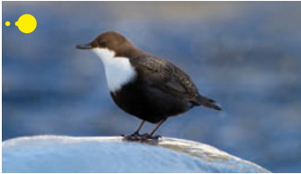
Ren Knight, Sussebilder

Dives to collect larvae in the water. Swims and runs under water. Black-brown with a white throat. Resident bird, but migrates if the stream freezes.