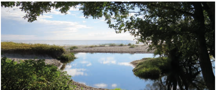
Backaleden follows the winding Verkeån to the sea